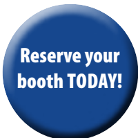
Exhibit Hall Dates and Times